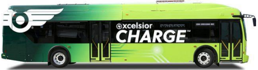
New Flyer Industries