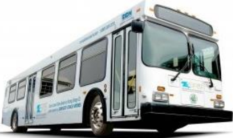
Complete Coach Works