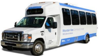
Motiv Power Systems